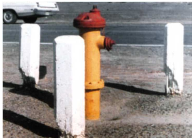
► Fig. 3: The bases of these concrete posts have suffered from sulfate attack (Portland Cement Association, 2002)